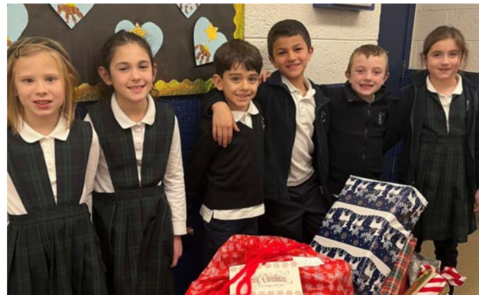
As a school, we have a comprehensive Christian Service program that allows students to participate in donating items for those in need, as well as hands on community service work. Here, you can see 5th grade students donating cereal boxes to CARES of Farmington Hills, 5th grade student caroling at a local senior living community during Christmas time, as well as collections for Adopt a Grandparent and the Parish Thanksgiving Food Drive. Service is an important way that the OLS community seeks to fulfill our mission.