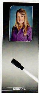
Dry Erase Locker Magnet