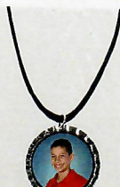
Bottle Cap Necklace