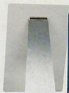
4x6 Metal Desk Print w/ Easel Back